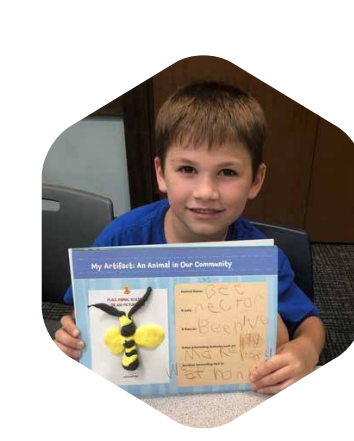
A young boy completes activities at the Leon County Eastside Library.

As a Ready To Learn grant station, there are many amazing projects we take part in within our community. One of these projects, Classroom Connection (a Tallahassee Chamber of Commerce Initiative), builds a solid foundation in early learning for children ages 0-5.